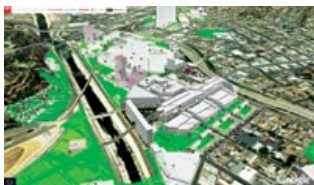
Figure 2. The 50-million-square-foot area east of Dodger Stadium was the focus of BIMStorm LA.

Planning System (OPS), a Web-based BIM collaboration platform.