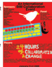
Figure 1. The Woodstock-inspired poster for BIMStorm LA.