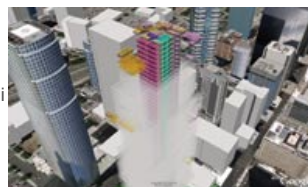
Figure 3. The use of open standards allowed projects created in different BIM tools to coexist in Google Earth's virtual terrain within the Onuma Planning System.

Team A included two architects and a government agency employee with expertise on project request